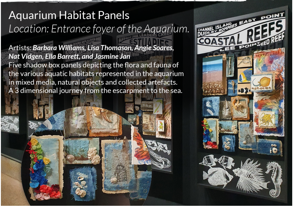
Aquarium Habitat Panels Location: Entrance foyer of the Aquarium.