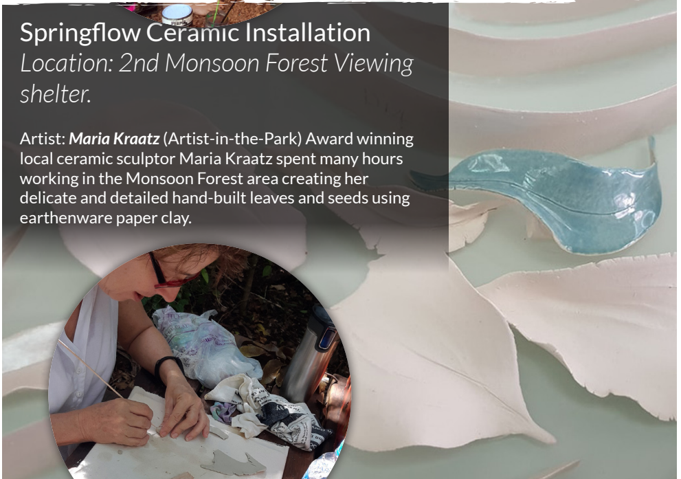
Springflow Ceramic Installation Location: 2nd Monsoon Forest Viewing shelter.

Artist: Marita Albers (Artist-in-the-Park) created a brightly coloured mural featuring animals of the Monsoon Forest and also painted the two giant Rainbow Frogs who sit nestled in amongst the reeds at the Monsoon Forest Station. Marita's brightly coloured murals can be seen in a number of locations in Darwin.