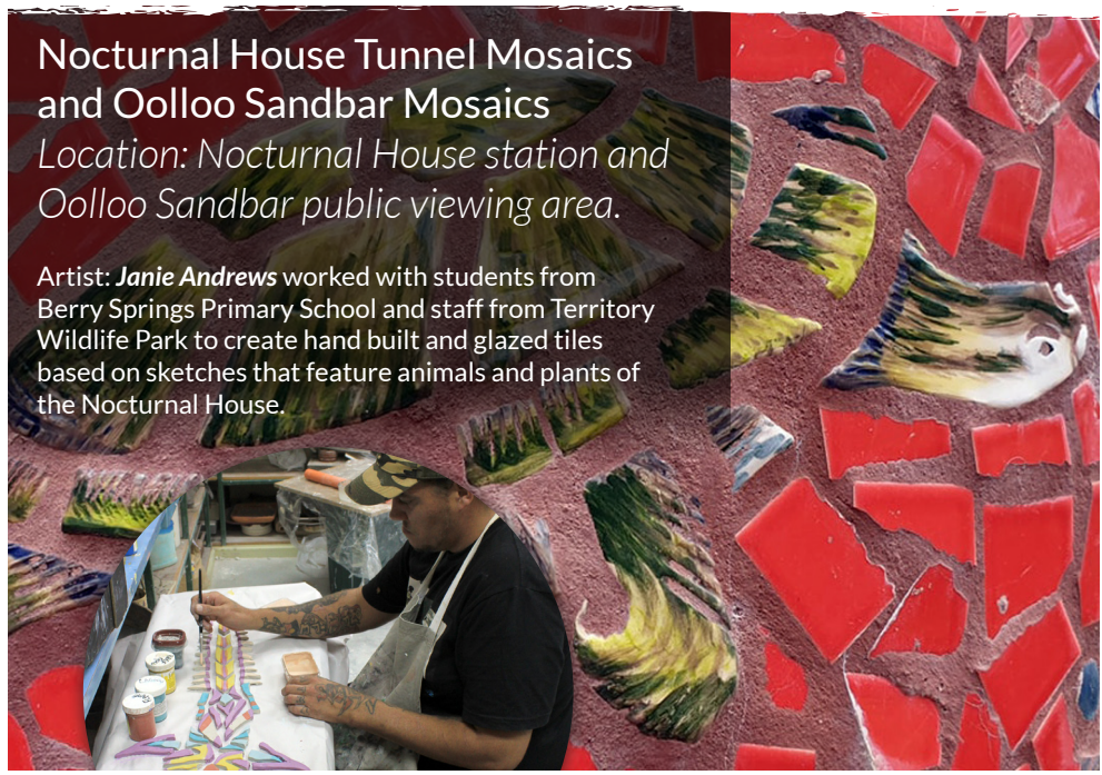
Nocturnal House Tunnel Mosaics and Ooloo Sandbar Mosaics Location: Nocturnal House station and Ooloo Sandbar public viewing area.

Artist: Techy Masero was commissioned to build a collection of animal lanterns out of steel and fibreglass. The lanterns were painted by Artists-in-the-Park, volunteers and Territory Wildlife Park staff and include a giant python, Pig-nosed Turtle, Flying Foxes and Archerfish.