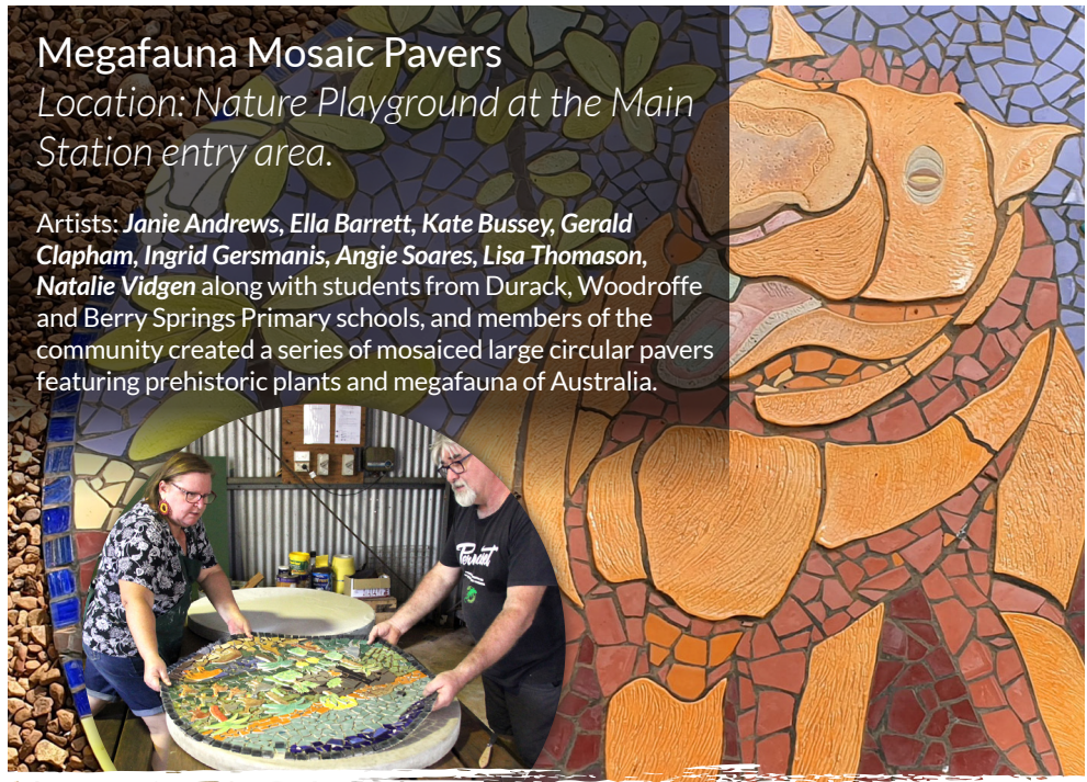
Mega fauna Mosaic Pavers Location: Nature Playground at the Main Station entry area.