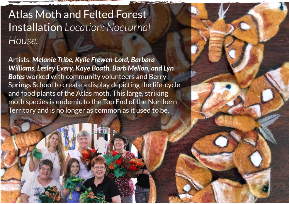
Atlas Moth and Felted Forest Installation Location: Nocturnal House.