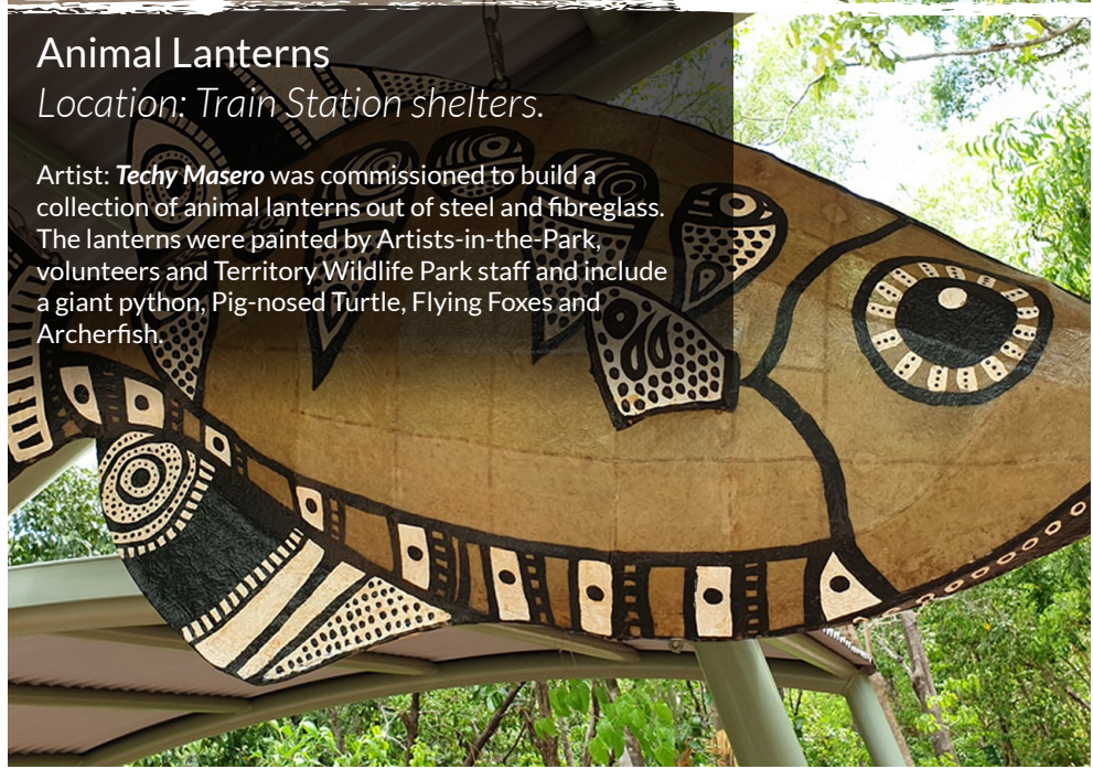
Animal Lanterns Location: Train Station shelters.