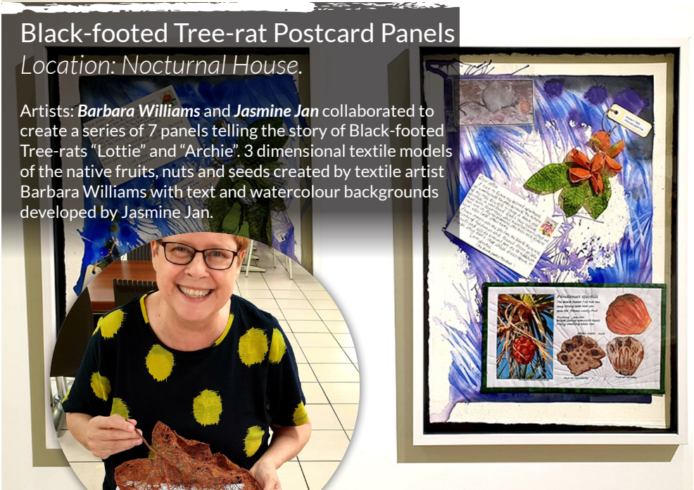
Black-footed Tree-rat Postcard Panels Location: Nocturnal House.

Artists: Peter Jettner and Troya Bywaters create animal sculptures using recycled and repurposed metal objects from farming equipment and tools. Their keen eye and great sense of design captures the quirky and unique characteristics of our native wildlife.