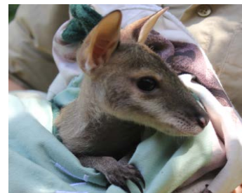
In the hand